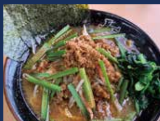
Hot Steaming Ramen