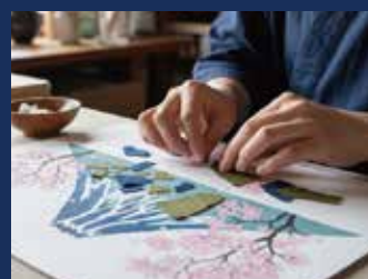
Collage & Paper Cutting with Washi