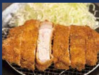
Crispy Pork Cutlet