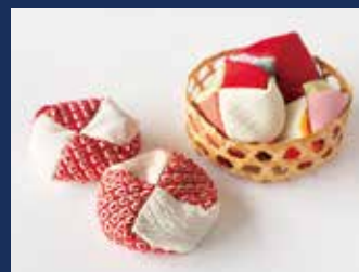
Traditional Beanbag Toss