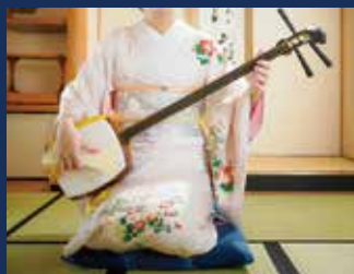
Local Japanese instruments Try-out