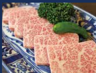
Juicy Wagyu Short Ribs

After a fun day on the slopes in Hakuba, just hop on a train! A relaxing short ride brings you to Shinano-Omachi — a cozy town where local restaurants greet you with warm smiles and hearty dishes that taste like home.