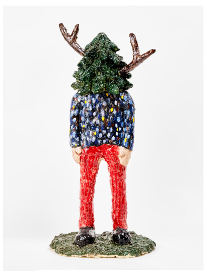
Yuichi Hirako, Soil 01, 2020, ©Yuichi Hirako

EMAIL: info@kotaronukaga.com URL: www.kotaronukaga.com TEL: +81(0)3 6433 1247 FAX: +81(0)3 6433 125