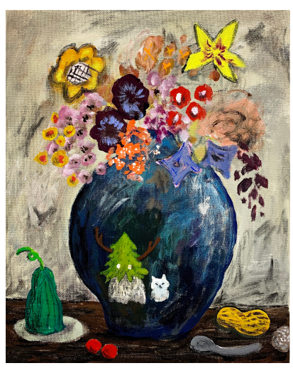
Yuichi Hirako, Anchor 01, 2020, ©Yuichi Hirako