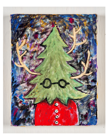
Yuichi Hirako, Nonchooser 01, 2020, ©Yuichi Hirako