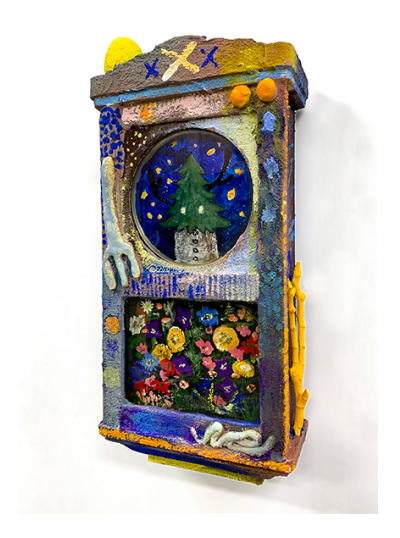
Yuichi Hirako, Tree ring 01, 2020, ©Yuichi Hirako