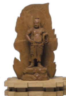
Hirakushi Denchu “Fudo Myo-o” Wood carving, with a box signed and sealed by the artist H37×W24×D18cm ¥7,500,000

The highlighted works of this season are “Visitor from the Ocean” by Arimoto Toshio, “Girl with a cat” by Foujita Tsuguharu, “Mt.Fuji” by Yokoyama Taikan, “Early Spring” by Uemura Shoen, “Puppies” by Maruyama Okyo. There are excellent works by Ogata Korin, Ikeno Taiga and more.