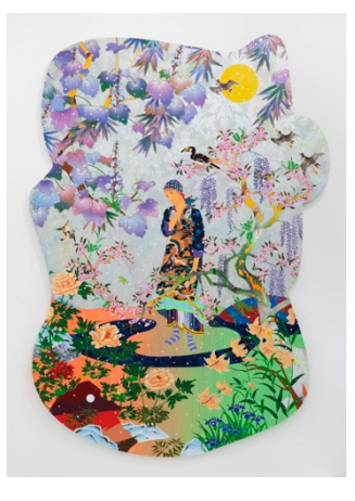
Tomokazu Matsuyama Swell Being Yourself Acrylic and mixed media on canvas 2019 103 x 73 x 1.5 in

Inka Essenhigh TBC Enamel on canvas 2019 32 x 24 in