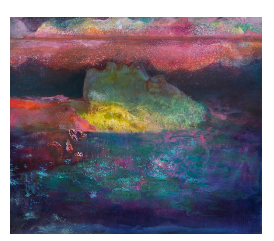
Firelei Báez TBC (floating woman) Acrylic on canvas 2019 43 x 45.5 in