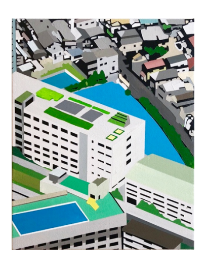
Brian Alfred Sky Tree View Acryric on canvas 2018 16 x 20 in