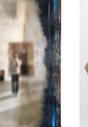
Nir Hod THE LIFE WE LEFT BEHIND Oil paint under chromed canvas 2019 90 x 63 x 1.5 in