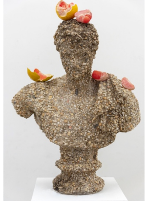
Tony Matelli Bust Concrete, painted bronze, painted urethane 2019 36 x 24 x 17 in