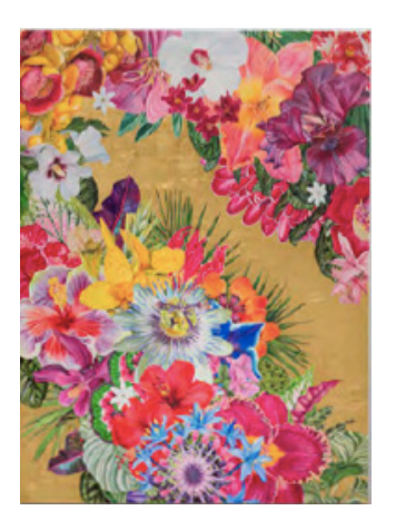
CarlosRolón Gild the Lily (Caribbean Hybrid II) Oil, ink, and 24kt gold leaf on linen 2018 72 x 54 in