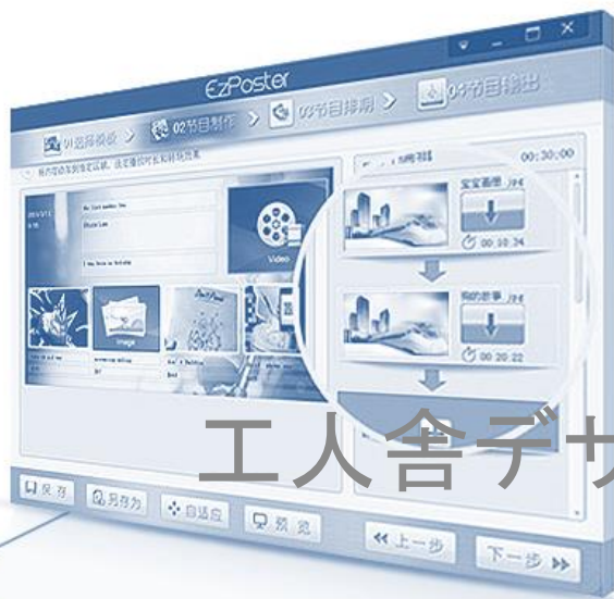
Step 2 Edit Content