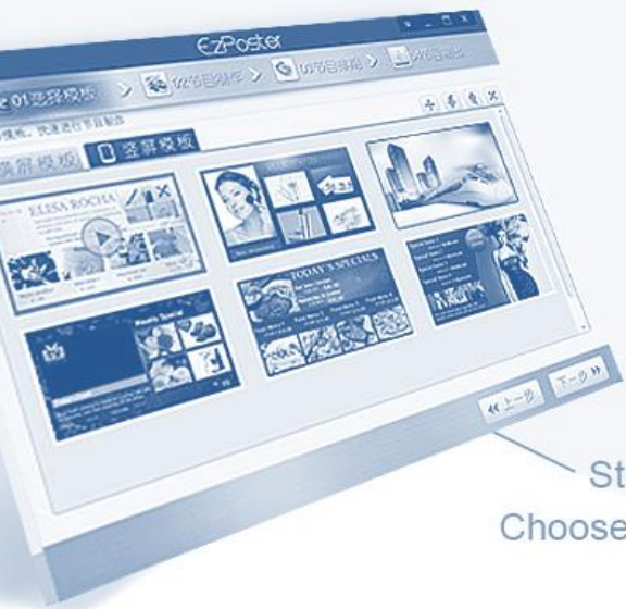
Step 1 Choose Template