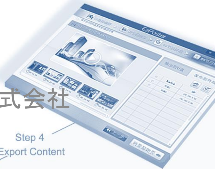
Step 4 Export Content